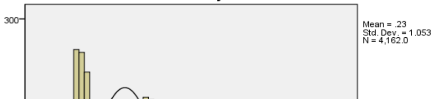
Distribution of Households by Wealth Scores Liberia MIS 2011

quintiles are based on the dejure household population (not households)