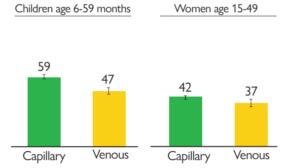
Any anaemia < 11 g/dl for children and pregnant women Any anaemia < 12 g/dl for nonpregnant women

Percent of children age 6-59 months and women age 15-49 classified as anaemic by capillary and venous blood sources